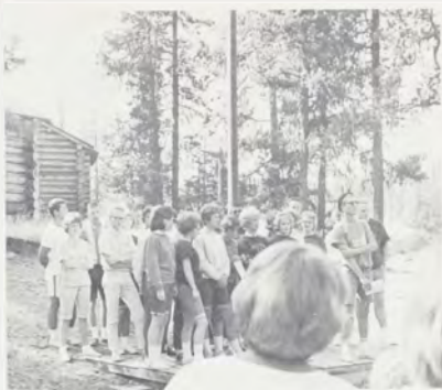
COUNSELORS' GLEE CLUB Old hands lead the newcomers in a round of Montana's traditional songs.