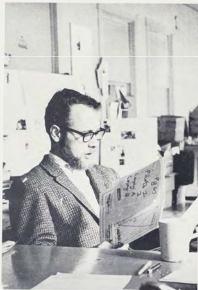
BRUCE McGOWAN , Photographer