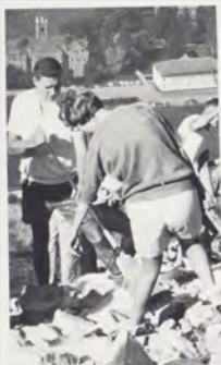
PAINTING THE "M" Freshmen practice Montana's oldest tradition.