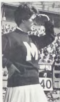
SCOUT Selecting the cheerleaders and pompon girls is another of T-Board's jobs.