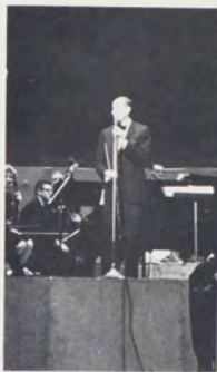
MANCHINI Special Events Committee arranged for his guest concert at Homecoming.

These various activities and features of the committee are paid for out of ASMSU funds and held in the interest of a more rounded campus life.