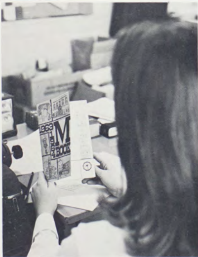
JUNIOR ENCYCLOPEDIA The now scarce "M" Book is used by freshmen, upperclassmen, and faculty—even the Sentinel staff as a reference book.