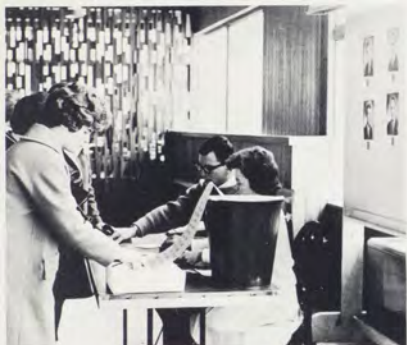
OLD MAN WINTER Girls vote for the candidate of their choice in the Yellowstone room of the Lodge.