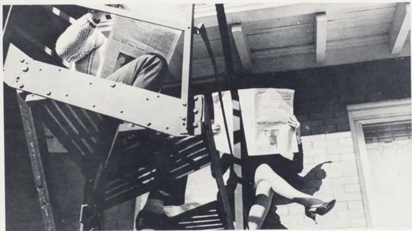
ANYTIME, ANYWHERE Everybody must read the Kaimin to find out the latest school news.