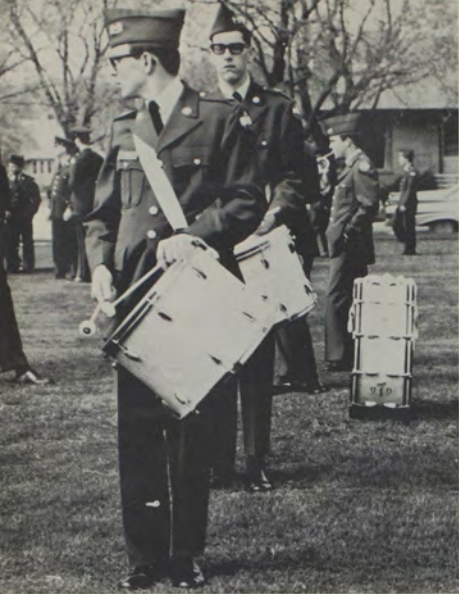
Drummers wait to set the cadence for their weekly drill on the Clover Bowl.