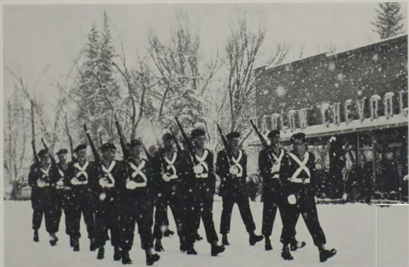
The Army ROTC drill team marched in Whitefish, Montana, this year.