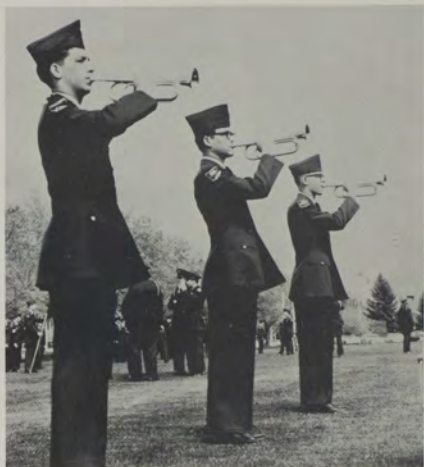
Before the drill begins, buglers have a few minutes to warm their instruments.