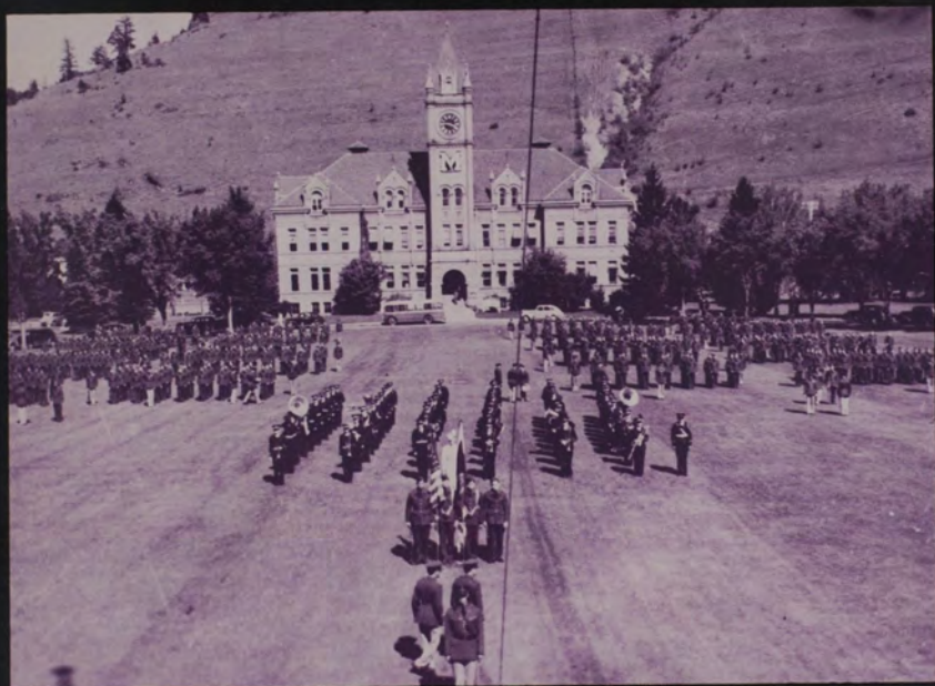
Sunday review during World War II