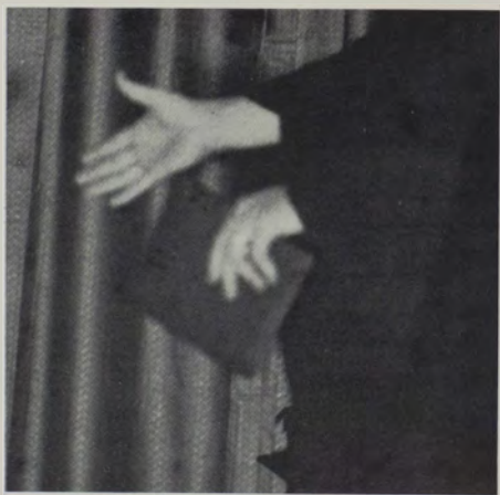
An anxious hand grasps a diploma and receives congratulations.

This is one of the 617 graduates who received a diploma in the 1968 commencement ceremonies.