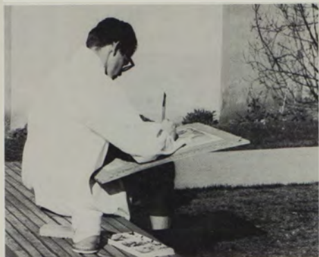
The School of Fine Arts houses an extremely experienced Art Department where students have the opportunity to learn the basics of all fields of art. Here, a student in a drawing class takes advantage of the Spring sunshine to capture a mood of the campus in charcoal, ink, or pencil.