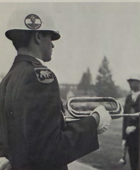
A member of the Army ROTC Bugle Corps stands at attention.