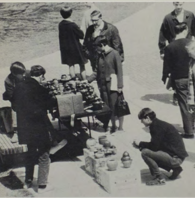
Many potters from the ceramics section of the Art Department held sales in front of the Lodge. The sales gave the students a chance to earn a bit of extra money. The competition was subtle but those with the most experience and the best creative ideas were the ones that sold most of their wares.