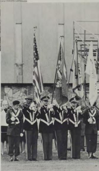
The Army Color Guard presents the colors at a football game.