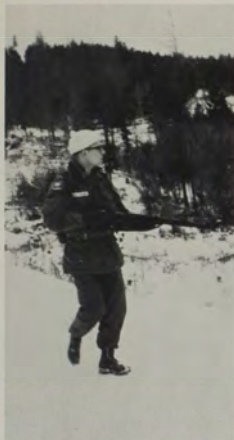
Cadet Baish searches for the aggressor during maneuvers.