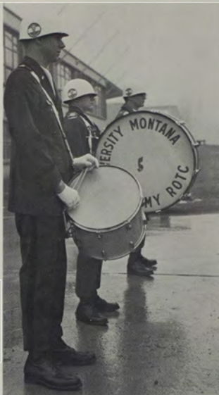
Members of the Drum Corps march not only in sunshine but also in rain.