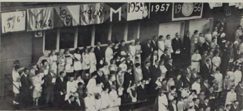
The U of M Field House was filled to capacity with parents, relatives, and friends. Banners from previous classes lined the building, announcing this as the 71st commencement exercise.