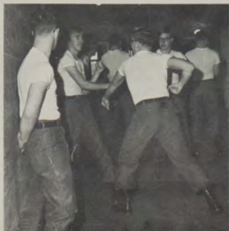
Counter guerrillas receive extensive training in self defense.