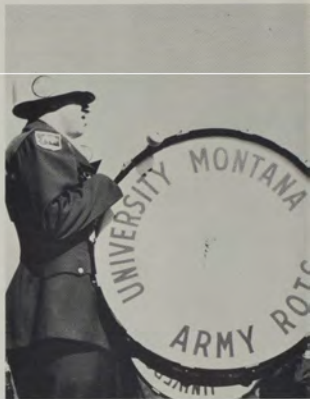
And to think I gave up a bugle for this!"