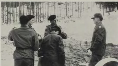
The counter guerrillas on maneuvers at Blue Mountain listen attentively to instructions.