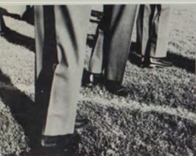
Right Face! . . . Left Face!