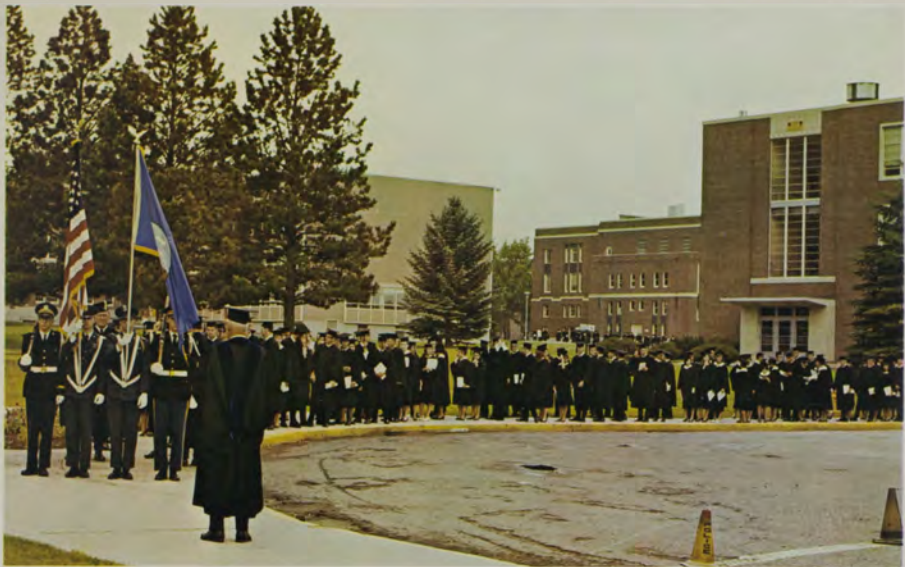
Prior to the beginning of the ceremonies, graduates find their place in line on the north side of the Oval and march to the Field House preceded by the marshals. With every name checked off and everyone accounted for, the ceremony begins.