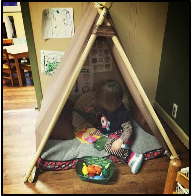
A child rests in the alone center while looking at books and choosing between calming glitter bottles.