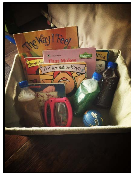
The center has several books a variety of sensory materials such as calming glitter bottles, quiet instruments, and a squeeze ball.