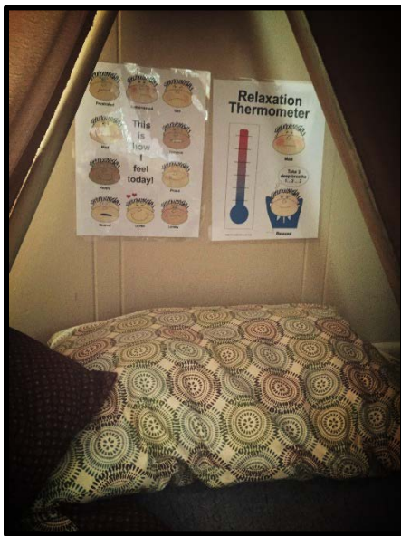
The soft cushion to lay on is accompanied by fluffy pillows and a weighted bean bag.