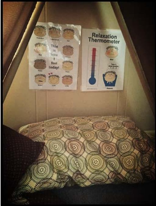
Hanging on the wall are two resources from the CSEFEL website regarding emotions and management of feelings.