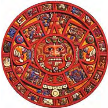
Aztec Calendar From: http://www.solarnavigator.net/history/aztecs.htm

Important dates: For information about deadlines regarding course changes, check out http://events.umt.edu/?calendar_id=27&upcoming=upcoming&